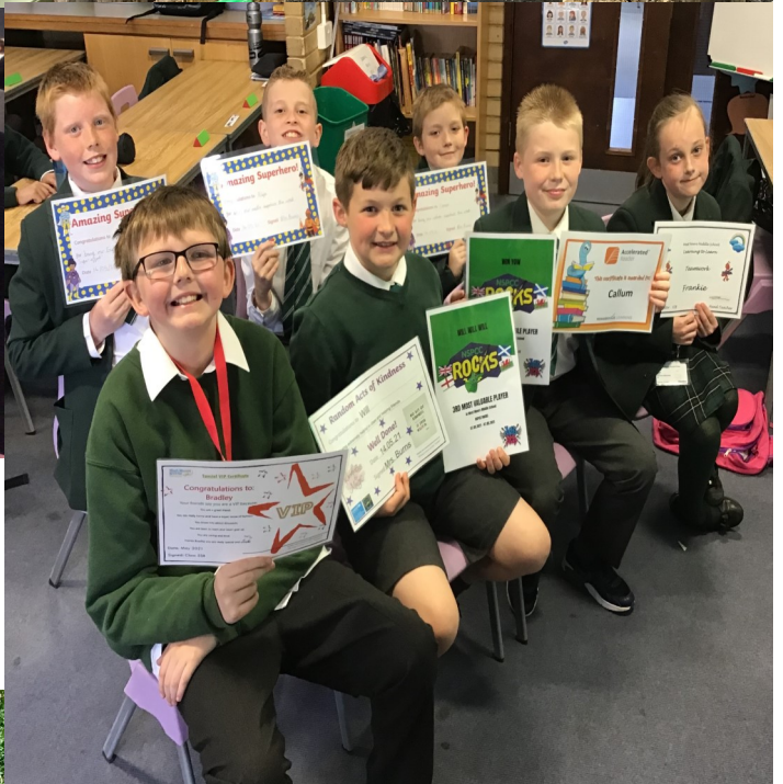
Year 5 at forest school, they played hide and seek and learnt about fire safety rules in preparation for next week. Excellent teamwork all round. Also some year 5 in celebration assembly.